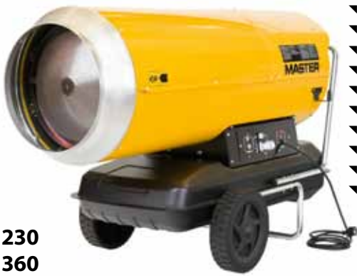
B 230 B 360